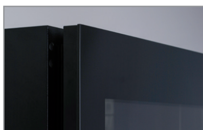
Porta a sfioro senza cornice Full glass frameless door

Dati indicativi e variabili a seconda dei diversi packaging / Variable data depending on the different packaging