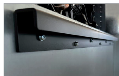
Staffa per appendimento a scomparsa Hidden hanging bracket