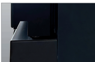
Maniglia integrata Built-in handle