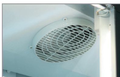
Motoventola assiale Axial fan motor