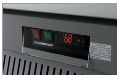
Termostato elettronico Electronic thermostat